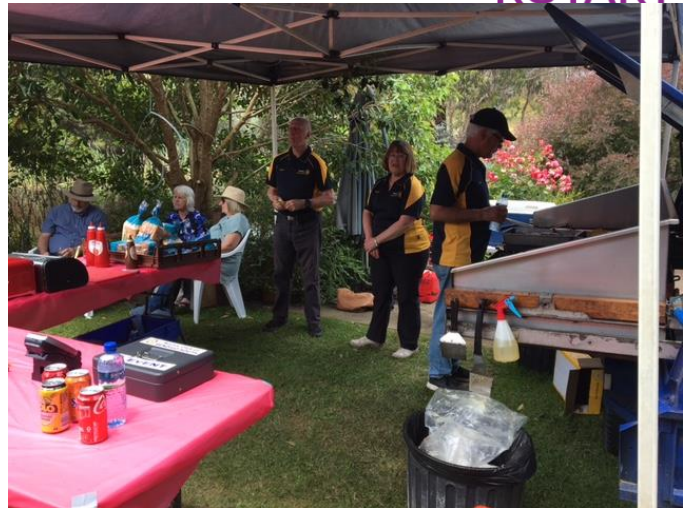
Mandurang Christmas Market