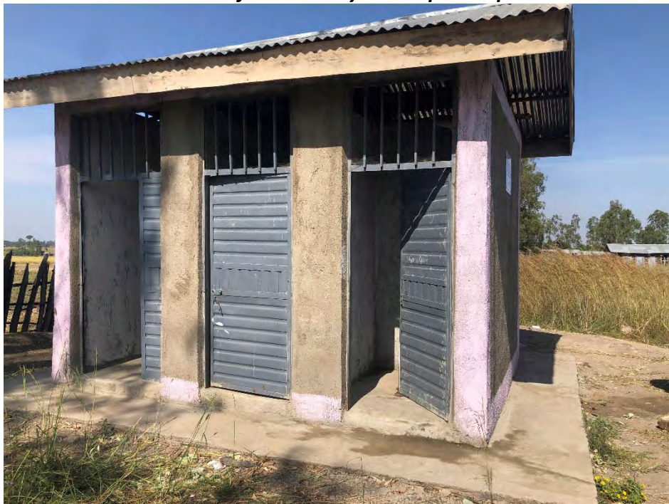
Newly constructed 6-unit girls' latrine toilet block at the Darcha primary and middle primary school, Ezha, Ethiopia