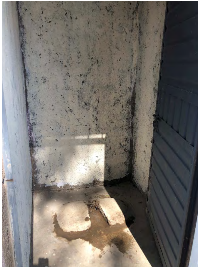
Traditional latrine pit.