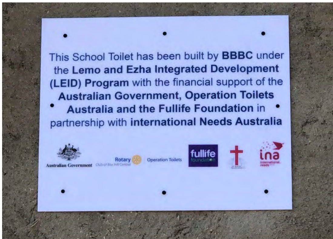
Our Club contributed $5,000 towards eWASH projects that funded this work.