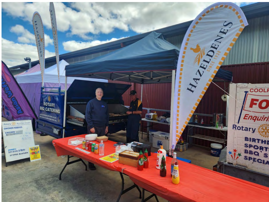
Bendigo Show / Hazeldene's BBQ.