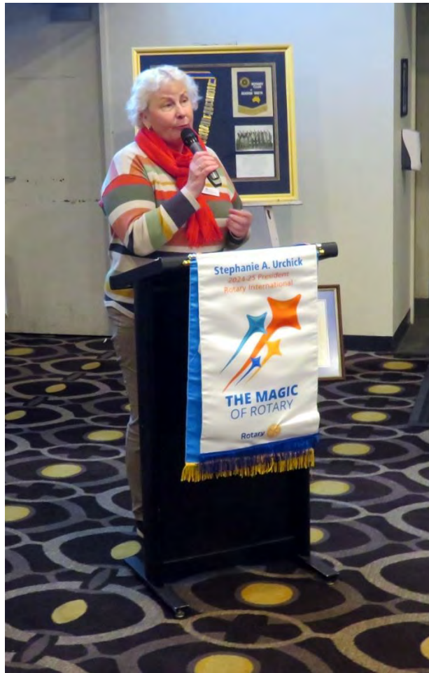
Mayor Cr Andrea Metcalf