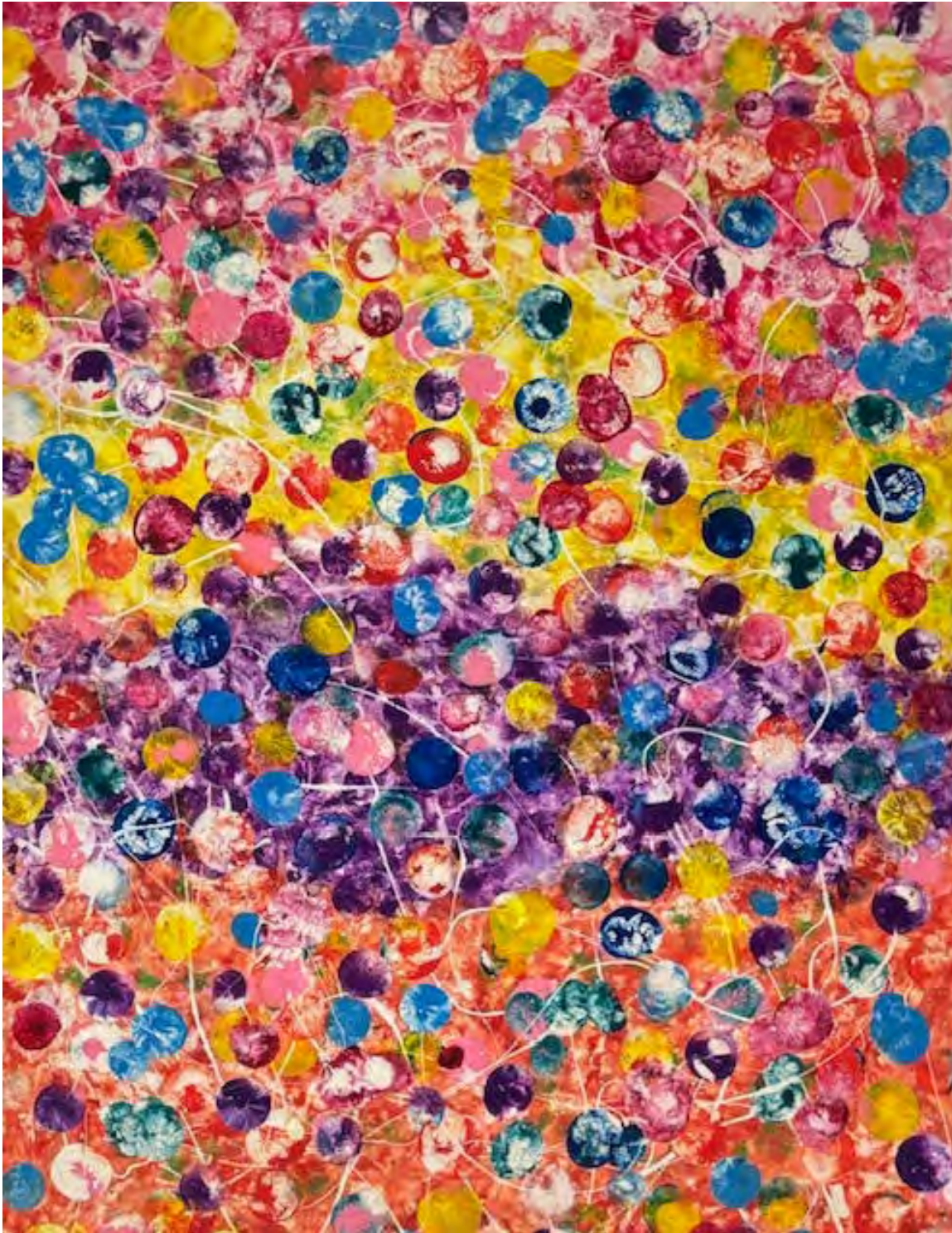
Titled: Carnival Acrylic on canvass – 120cm x 90cm