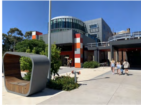
LaTrobe University BBQ