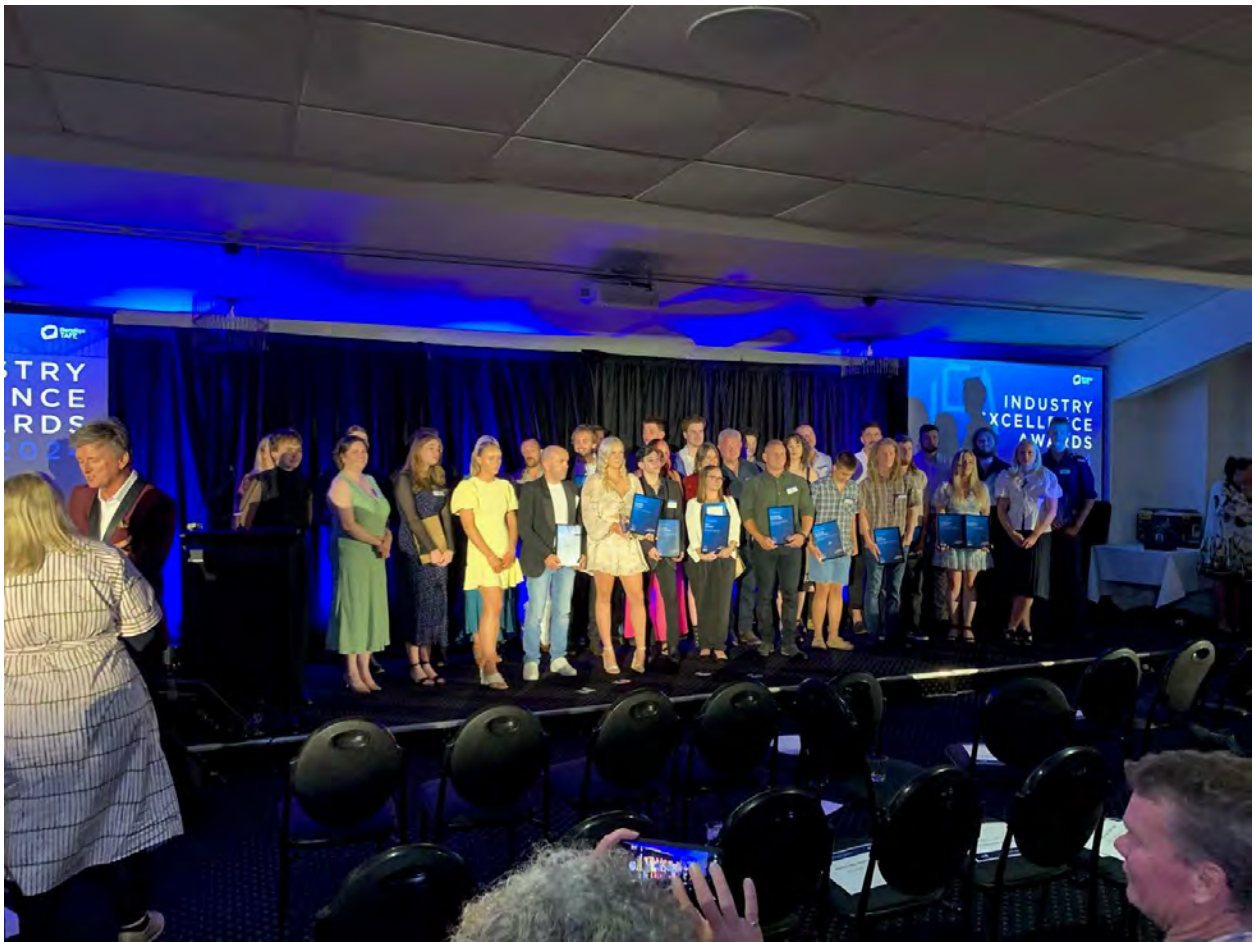
2024 TAFE Industry Excellence Awards recipients last Wednesday night (21 Feb 2024)