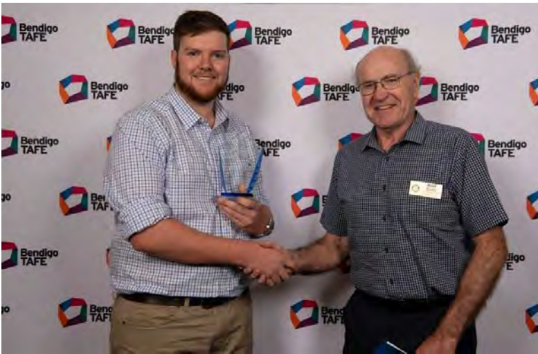
Bendigo TAFE Apprentice of the Year