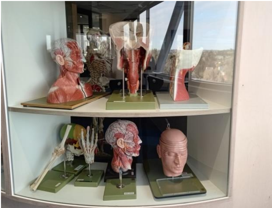
Display in the Anatomy Lecture Room