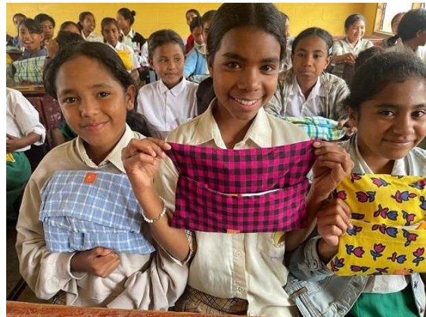
The Bendigo Maubisse Friendship Committee has a number of ongoing projects that are being delivered to the Maubisse community.