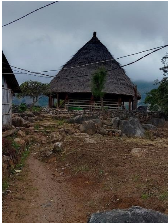
A view over Maubisse and surrounding hill, and a replica traditional East Timorese dwelling.