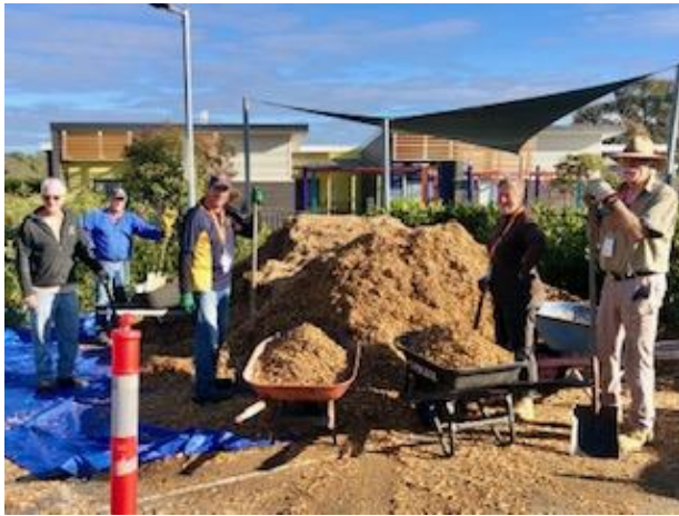
The Annie North Women's Refuge gardening team replenishing the soft fall in the playground.