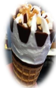
Hmm, a Cornetto to finish off with!