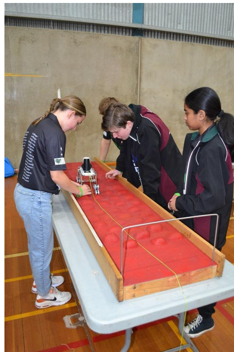
Moon rover challenge