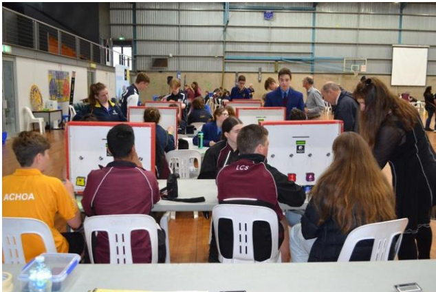
Power supply challenge