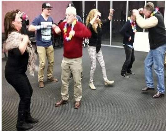
Have to love the "Chicken Dance"!!