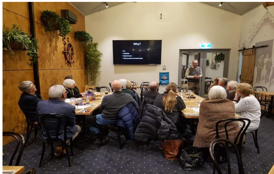
Guest Speaker Matt Oliver - Photographer