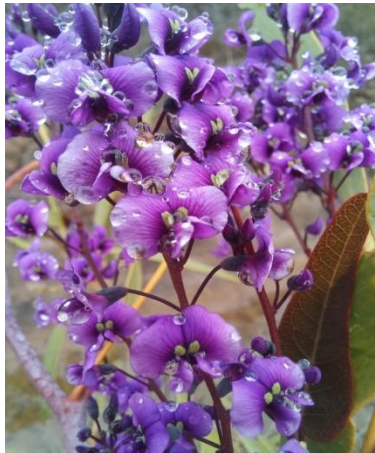
Hardebergia – Purple Coral Pea