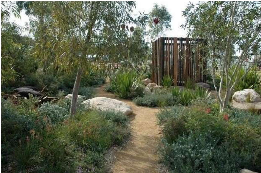
Proposed design idea for the new Camp Getaway garden