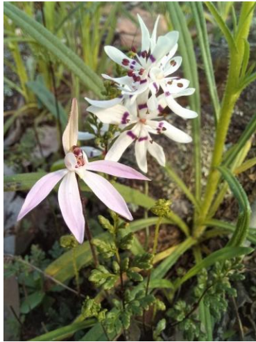
Calandenia with Milk Maids