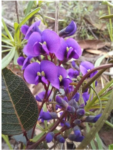
Purple Coral Pea