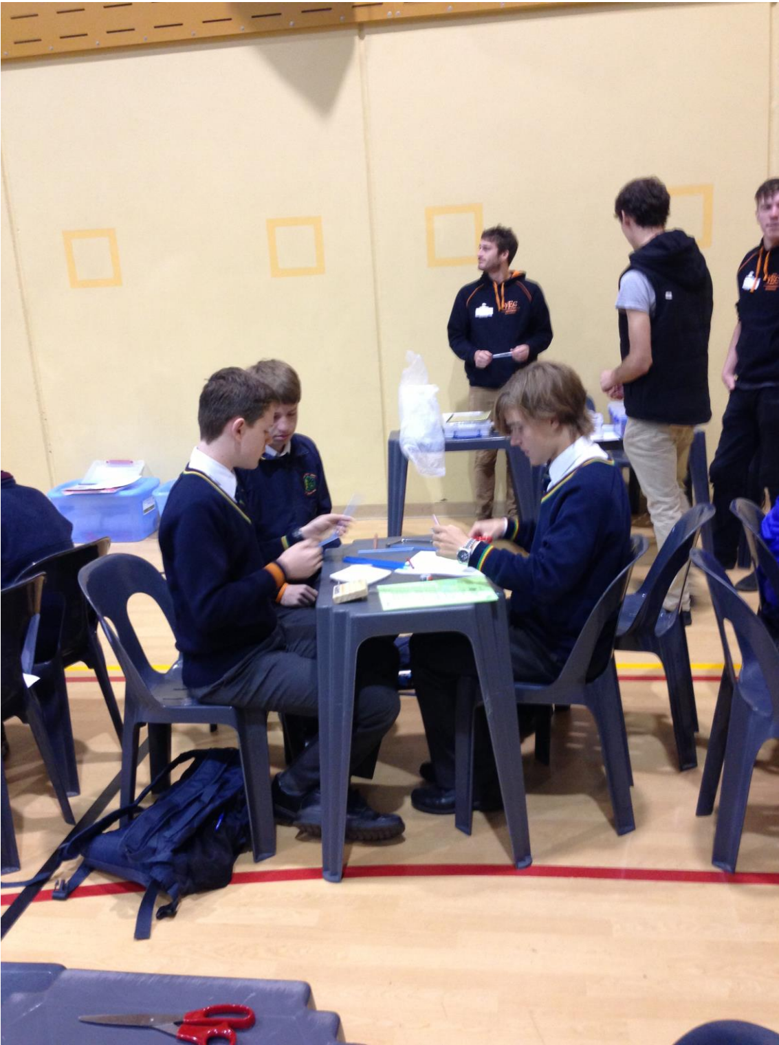
PHOTOS FROM OUR SCIENCE & ENGINEERING CHALLENGE