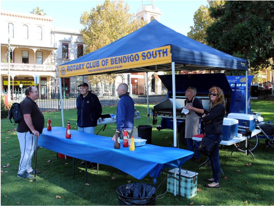
BBQ last Friday