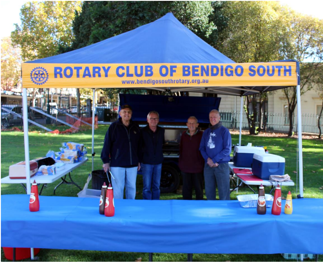
BBQ last Friday