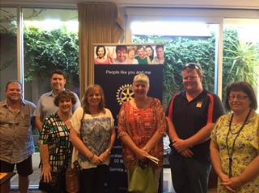
Donations being made to various organisations from the Bendigo Swap meet