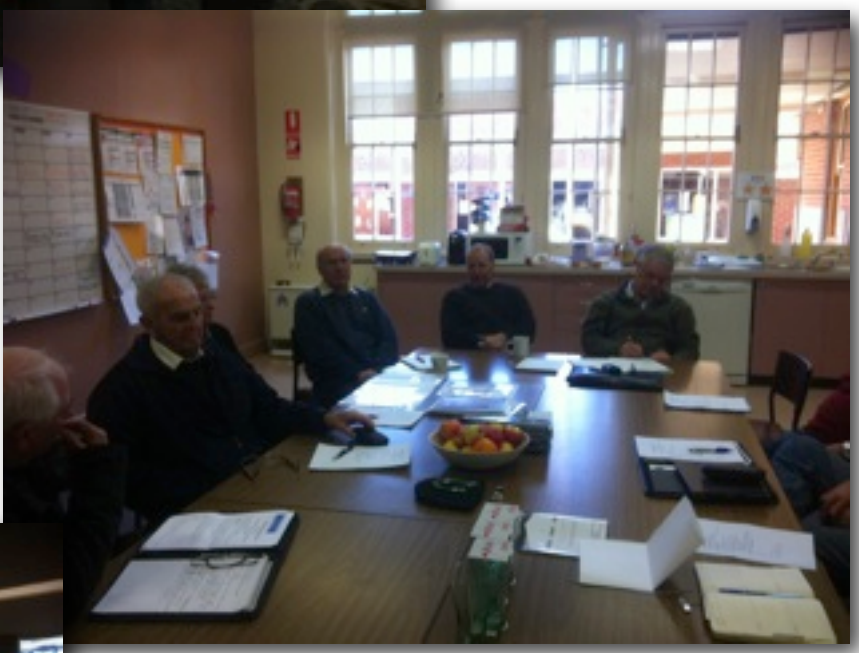
BELOW & RIGHT: Last Sunday members gathered at Bendigo Violet St PS to discuss membership matters and the goals of the club. Below are all of our ideas on the whiteboard.