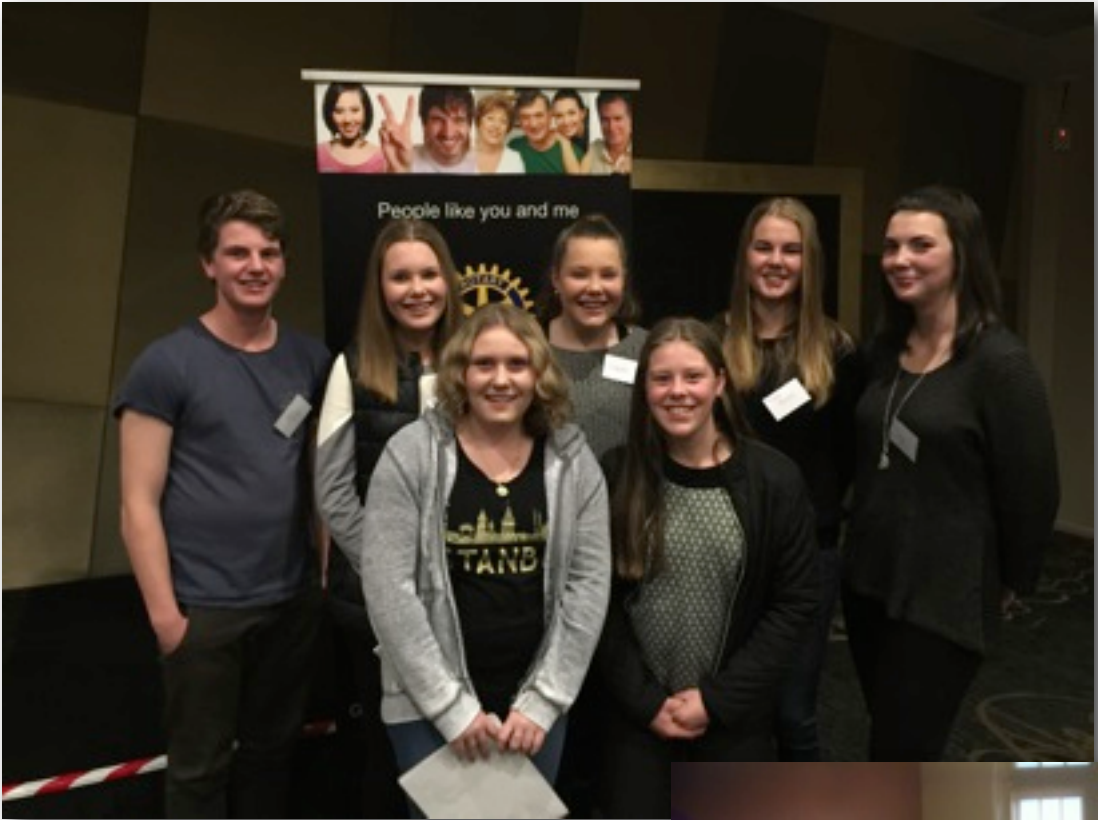
LEFT: Students from East Loddon P-12 last Thursday told us about their trip to Turkey, to visit their sister school and commemorate the centenary of ANZAC day.