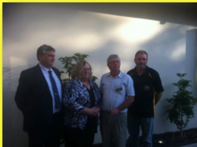
LEFT: Members from the Rotary Club, as well as various other charities and organisations who are helping to facilitate our upcoming fishing competition next year.