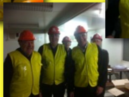
Members exploring the Keech Castings factory last Thursday evening.