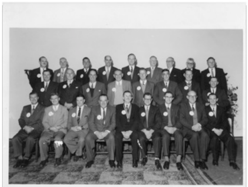
Members of the Rotary Club of Bendigo South in 1962-63