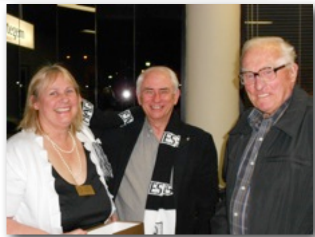
Bendigo South Rotarians and Friends enjoying a visit to Strategem Financial, dressed in footy colours.

And at the top, that 'suspicious' computer with 3 monitors .