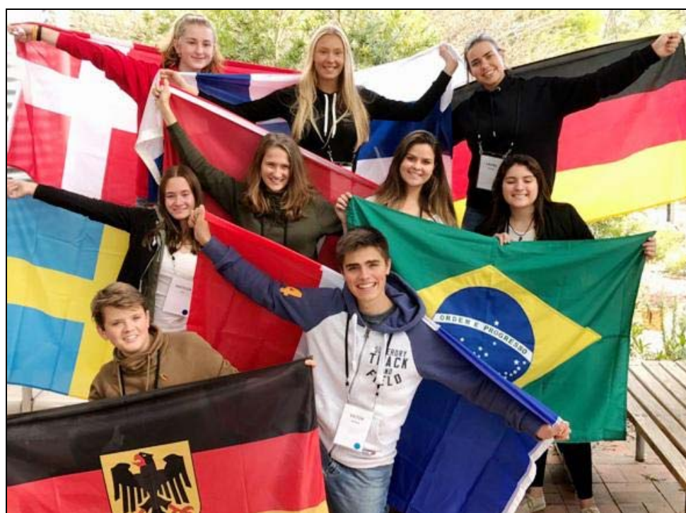
Youth Exchange students at the D9800 briefing for inbound and outbound students at Camp Getaway last weekend.