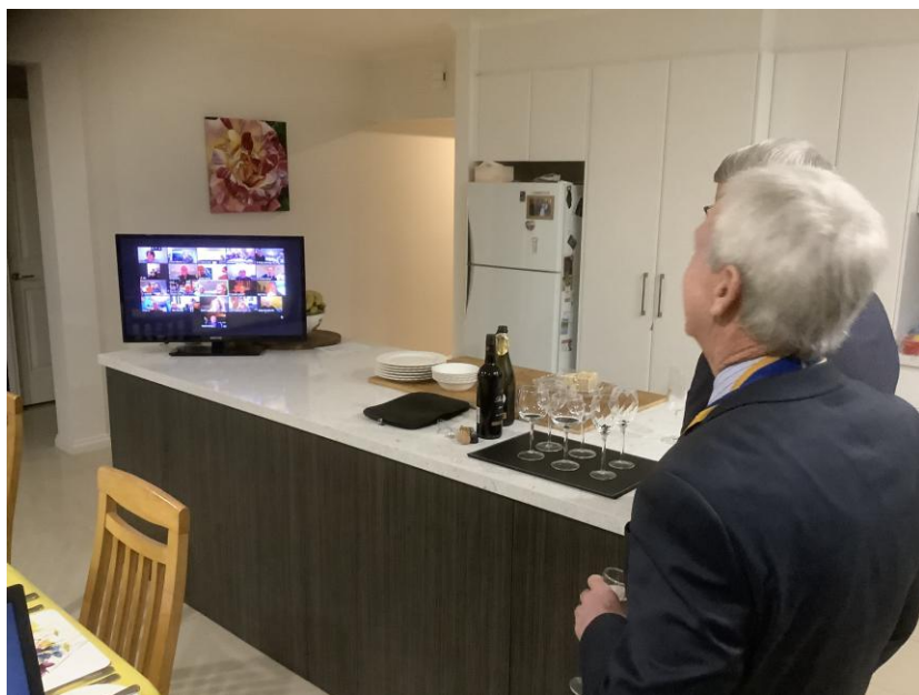
ZOOM in Action