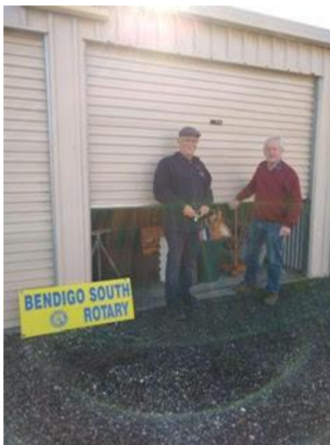
Making sure the key works.....