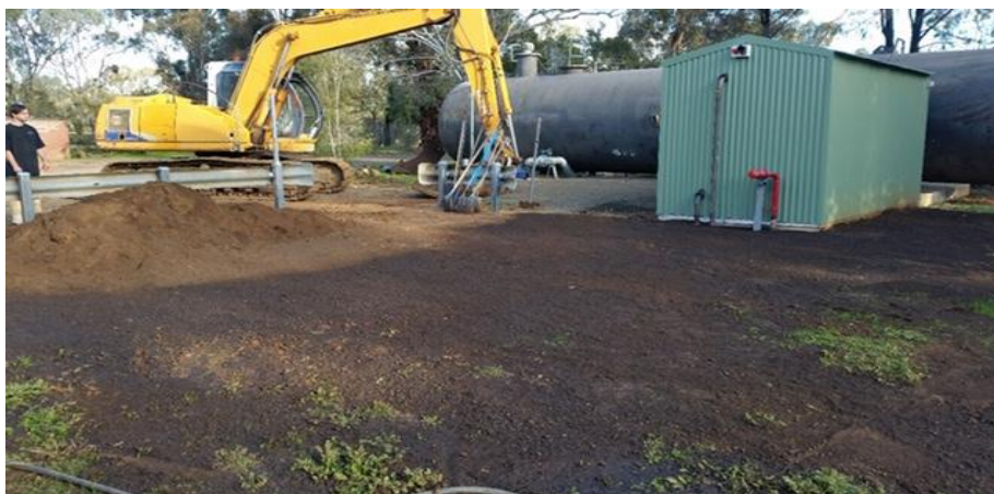
Busy at Camp Getaway!