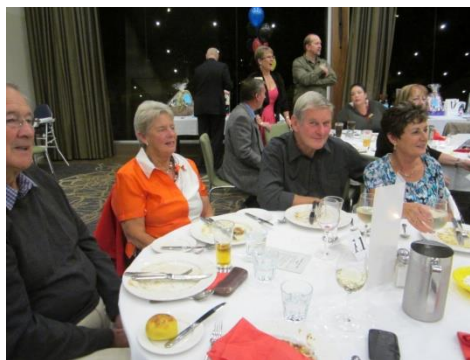
Multicultural Dinner Dances