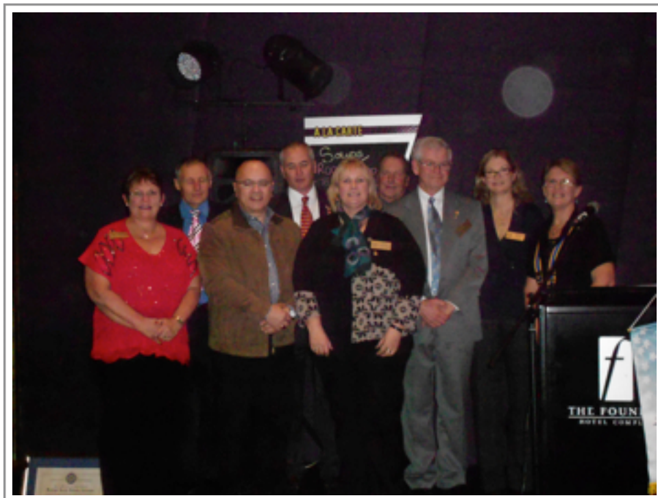
Induction of the 2012- 2013 Rotary Club of Bendigo South Board of Directors