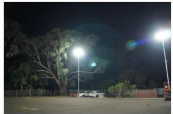
Flood Lighting on Show

this project was anticipated around mid-July 2022. However, due to circumstances, some of which were beyond our control, this do-by date is now mid-July 2023. But we are getting there. The playing surface has been re-asphalted, the courts line marked and the flood lighting installed, as shown in the accompanying photos. We managed to obtain a State Government Grant through DELWP (now DEECA) during the year to fund a second solar installation, which included battery storage. This will assist in lowering our energy bills and is another step towards becoming independent of the grid.