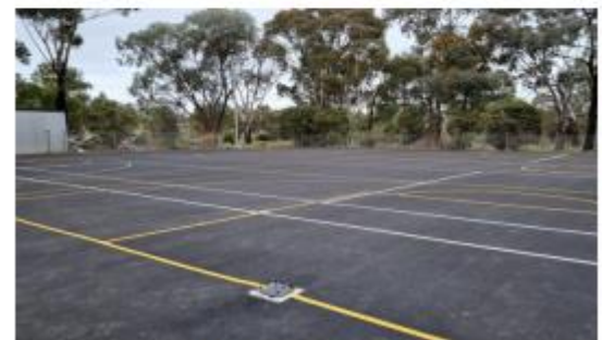
Courts Line Marking

Other smaller capital projects included the completion of the trailer storage shed and the replacement of the four air conditioning units in Dormitory One. We were also able to secure a variety of catering and furniture items at auction with the closing down of the Mt Aitken Conference Centre at Craigieburn. All of our crockery has been replaced and some kitchen equipment and a number of new tables and lounges have been acquired. We are now on the lookout for replacement cutlery (at the right price).