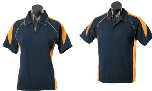
Ladies – no buttons