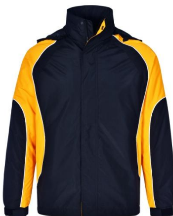
One design for the Jacket