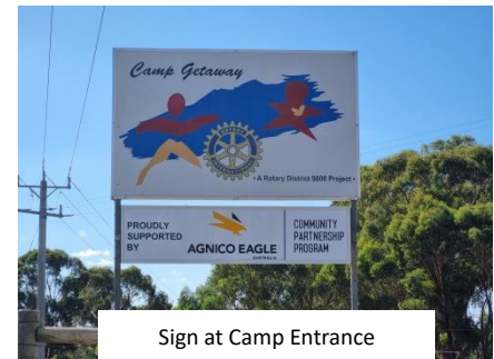
Sign at Camp Entrance