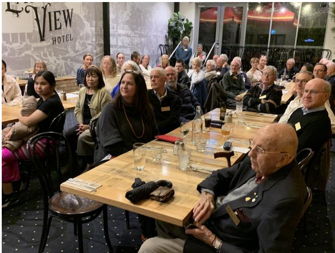
Members and guests enjoying presentations from secondary school scholarship recipients