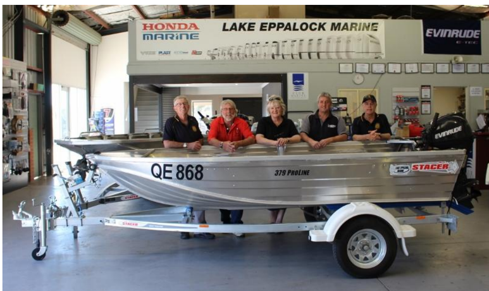
Bendigo Health Orthopaedics Ward project boat raffle winners